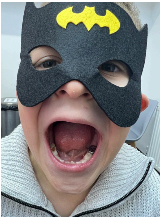
Stainless steel crowns fitted on a superhero!